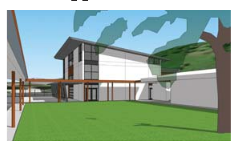
Sleepy Hollow Elementary School multi-purpose room Option 4 - New MPR at Lower Parking Lot.